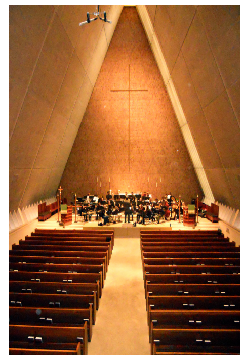
Kramer Chapel at Concordia Theological Seminary in Ft. Wayne, IN.

The orchestra performs in the "Light of the World" Christmas concert, running until Dec. 10.